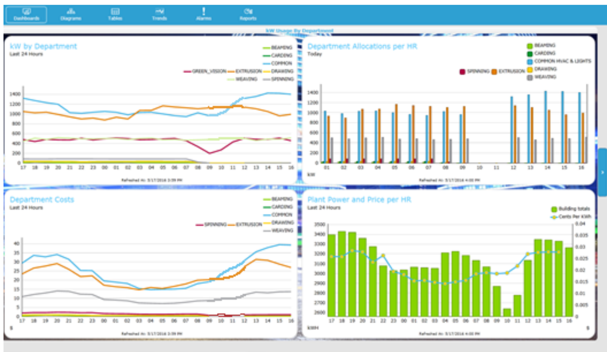
Energy Management Dashboard

The results were beyond expectations. Awareness of various power loads at different times enables the customer to adjust operations for maximum efficiency. The automated system produces an instantly available dashboard of energy trends to further improve performance.